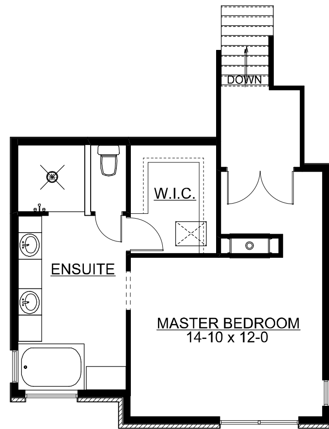
UPPER FLOOR PLAN 483 SQ FT